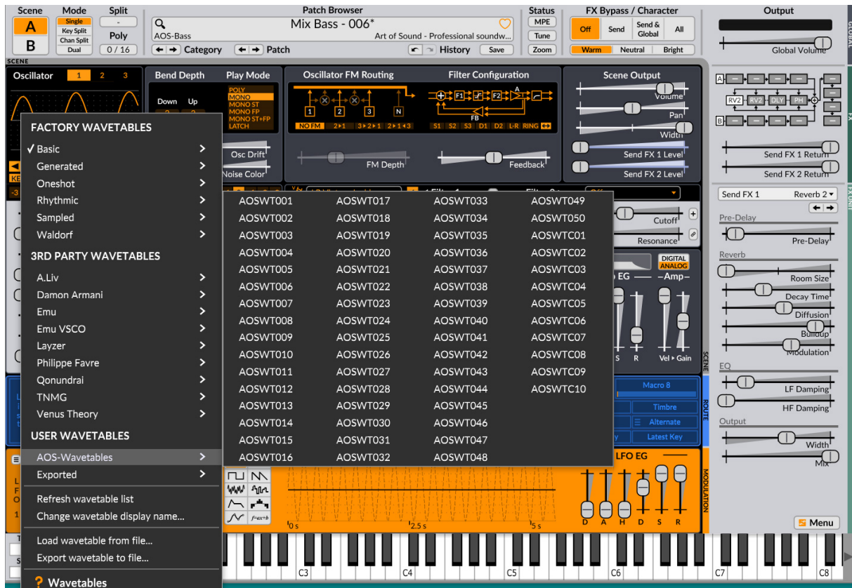
Figure 2: Wavetable selection menu in Surge XT

AOS-Wavetables are now activated and ready to use in all presets from the Infinite XT – Volume 1 collection